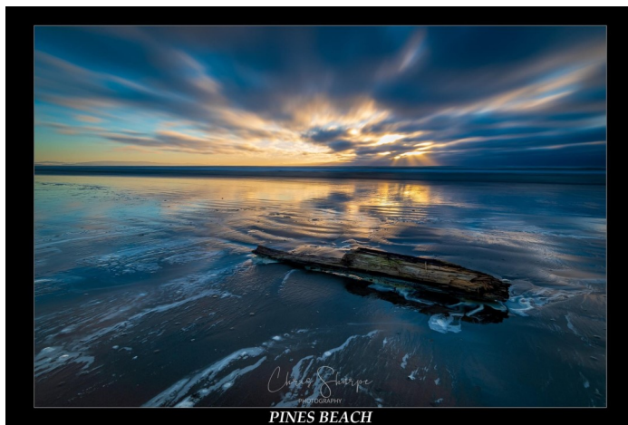
An incredible photo of Pines Beach