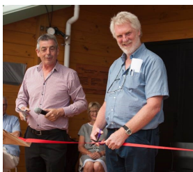
The day the new hall opened